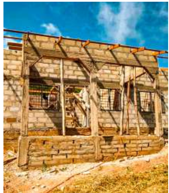
Work in Progress – Front Elevation