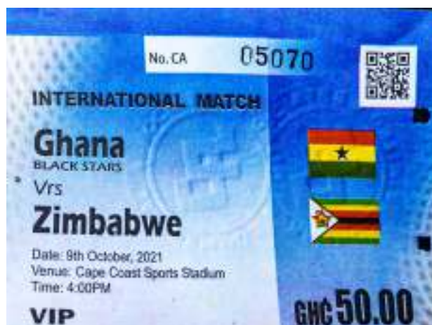
Ticket for the Zimbabwe Match

You'll be glad to hear that it's not 'all work and no play' for our volunteers and interns. On Oct-9th, some of them attended an international soccer match in Cape Coast – Zimbabwe vs. Ghana. We're happy to report that Ghana won 3-1. On Nov-30 th , we had a local football match between a team from Ahoto, including many volunteers, and a team from Kuful. Thankfully, Ahoto won the game.