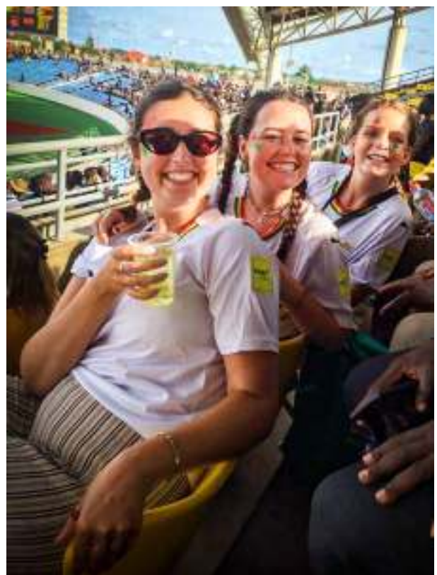
Irish Volunteers at the Zimbabwe Match