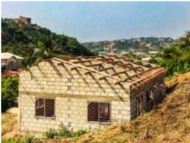
Quad's New House in Moree Village