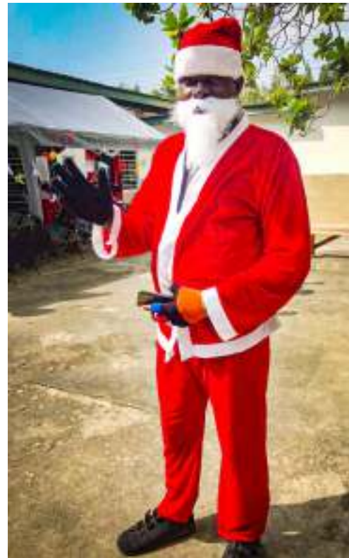
Santa made a special appearance