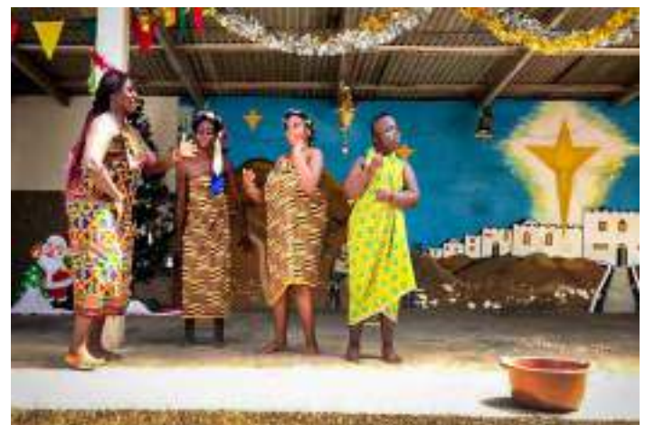
Nativity Play 8-Dec-21