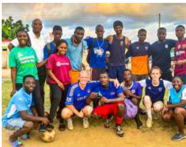
Ahoto Team that beat the Kuful Team

The students are residing at St. Joseph's and will be assisting in our outreach programs – working with the local communities in Kuful and Ntranoa on advocacy and fostering disability awareness.