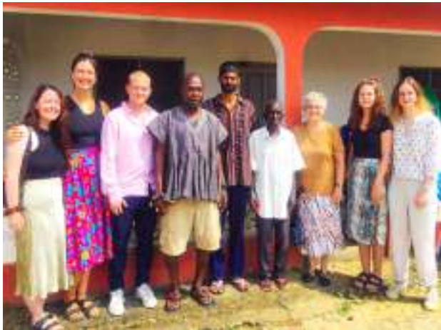
Volunteers meeting the Chief of Abee