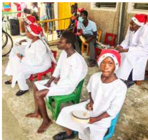
Nativity Angels waiting in the wings