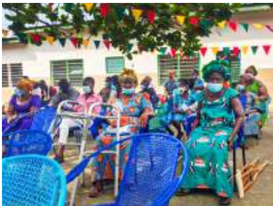
Audience – Outdoors + Socially Distanced

Major preparations were underway for many weeks as the season's highlight rapidly approached. Everyone had a great time on Dec-8th, and the play went off without a hitch.